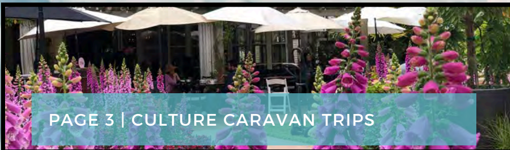
PAGE 3 | CULTURE CARAVAN TRIPS