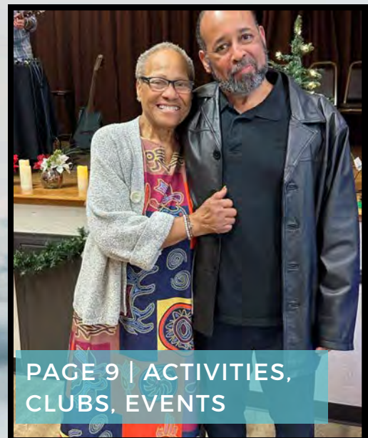
PAGE 9 | ACTIVITIES, CLUBS, EVENTS