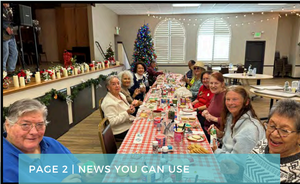
PAGE 2 | NEWS YOU CAN USE