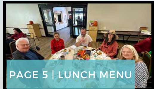
PAGE 5 | LUNCH MENU